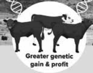
Greater genetic gain & profit