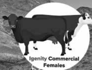
Igenity Commercial Females