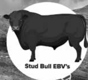
Stud Bull EBV's

Start by using DNA testing portfolio Igenity ®