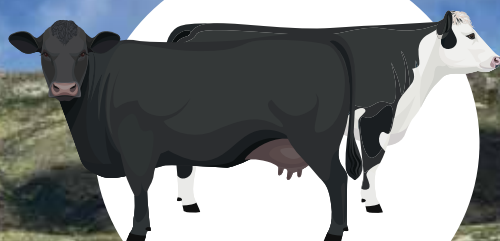
Igenity Commercial Females