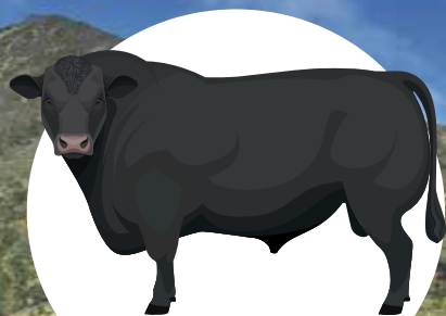
Stud Bull EBV's